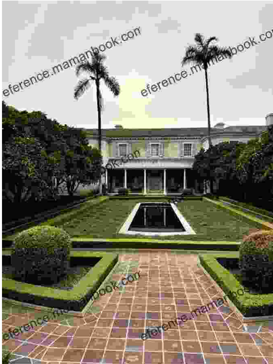
A photograph of the Bellosguardo mansion in Santa Barbara, California.