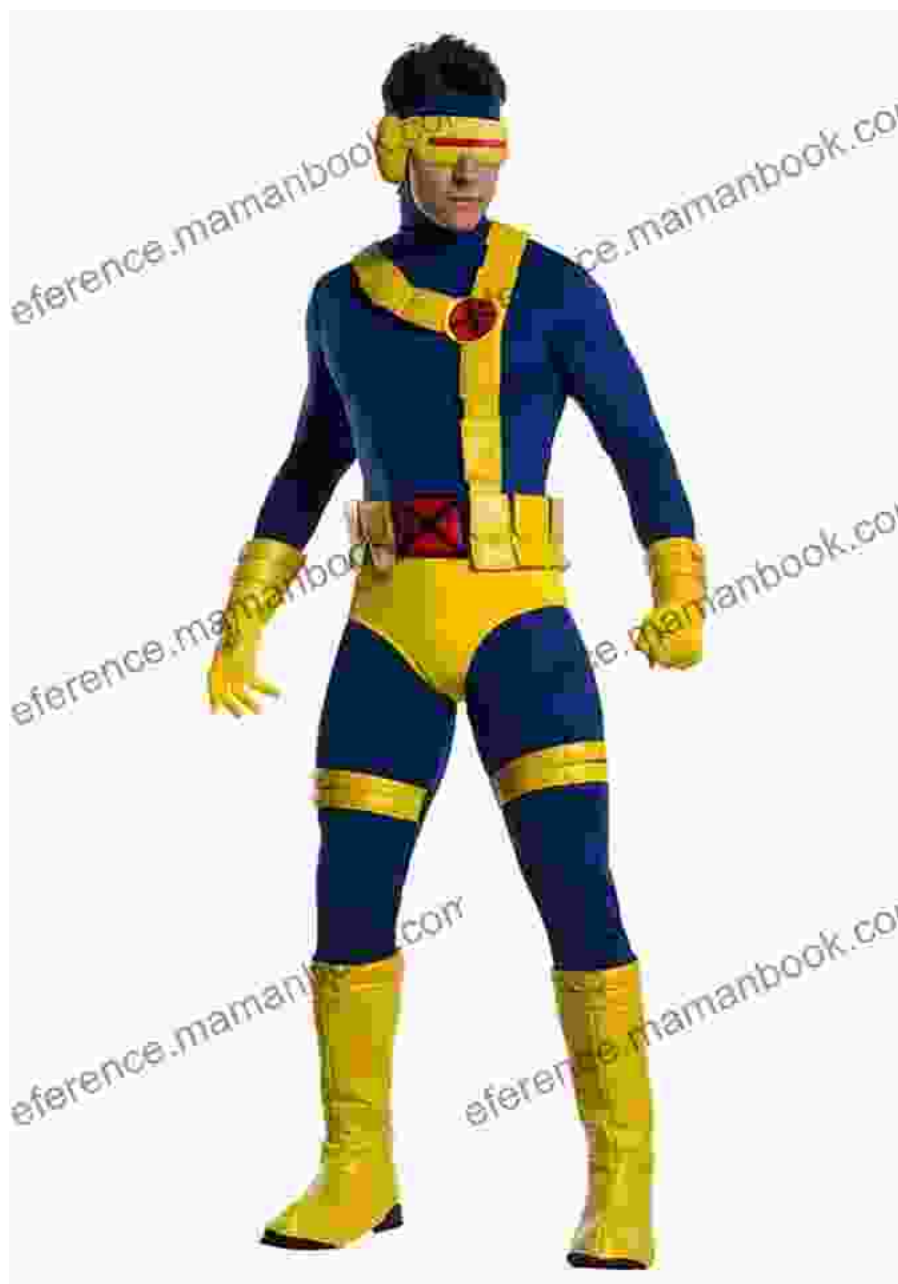
Cyclops, leader of the X-Men.