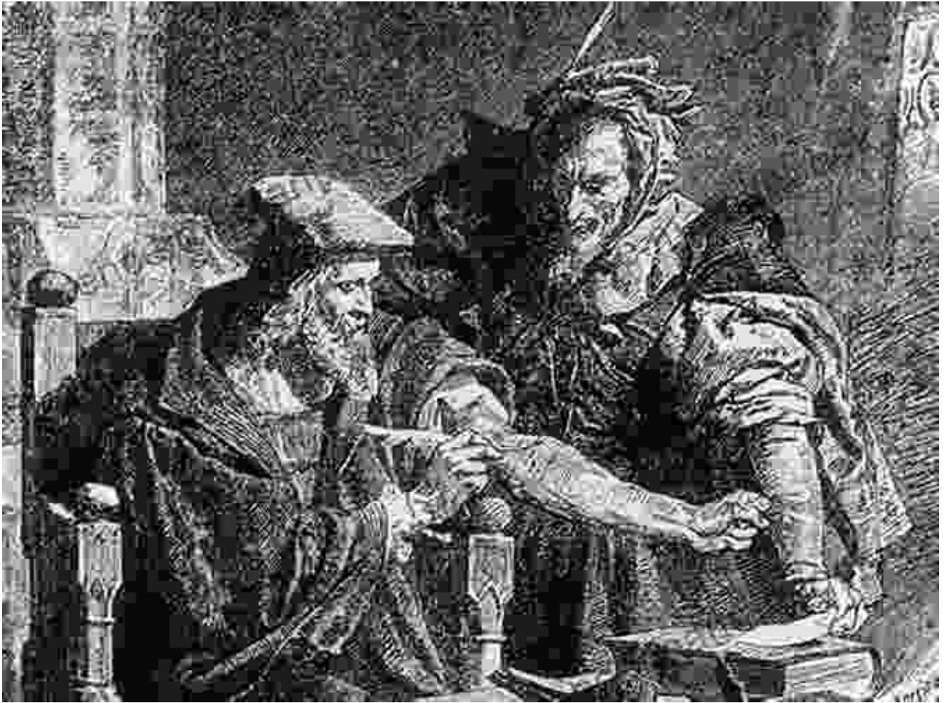
Doctor Faustus , by Franz von Stuck